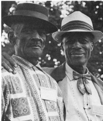
Son House & Mance Lipscomb