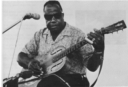
Bukka White (Booker T. Washington White)