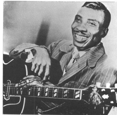
Aaron T-Bone Walker

The purpose of these memoirs is to shed a bit of light on the human side of many deceased blues artists who have become legendary figures, and as a result, distant icons to younger/newer enthusiasts. The new generation is left with photographs, records, and academic biographies, but little knowledge of what these "old guys/gals" were like as people. I aim to describe how they appeared and sounded, offstage and on, to make these heroes more understandable as people who expressed their human experience through their music.